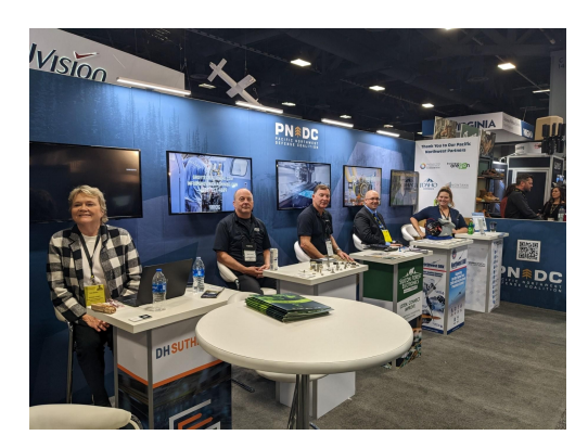
AUSA Annual Meeting October 9th - 11th, 2023