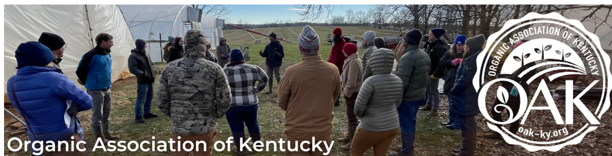
Organic Association of Kentucky